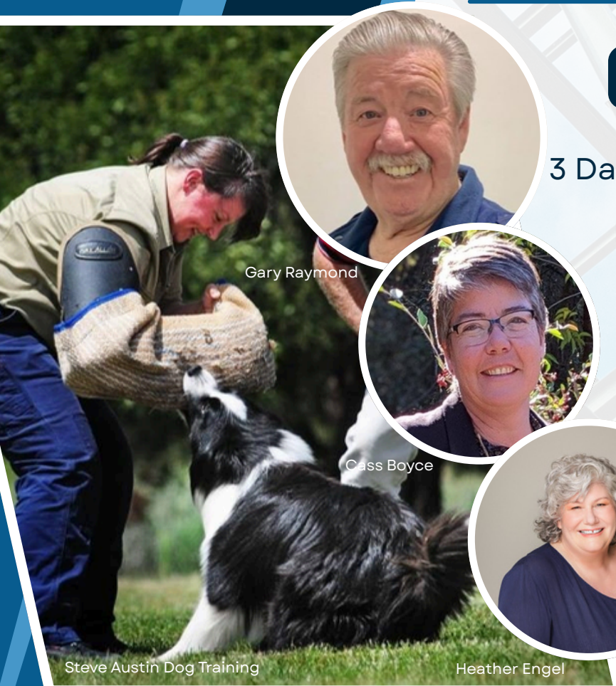
Steve Austin Dog Training